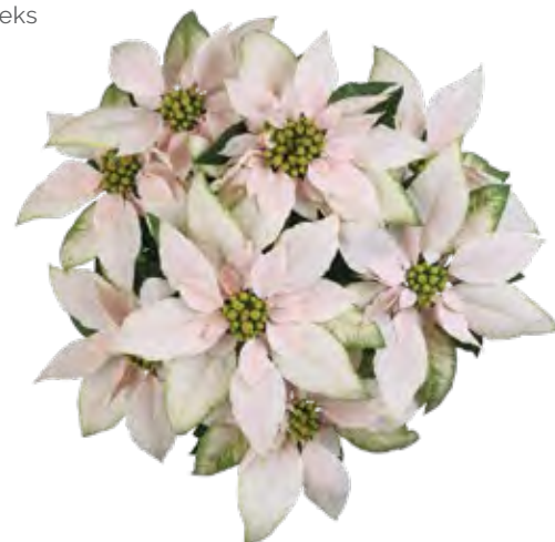
J'Adore White Pearl 10155 | 7.5 weeks