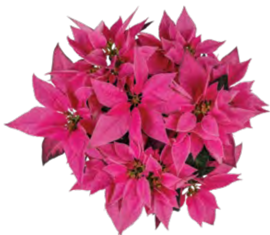
J'Adore Dark Pink 10154 | 7.5 weeks

J'Adore is a series of interspecific euphorbia hybrids for dynamic, modern-day holiday décor. These varieties give your program a touch of luxe with layers of velvety bracts in pastel pink and rich touchable textures. The versatility of J'Adore varieties allows us to lean on these performers from the early season, all the way through New Year's promotions, for an elegant and glamorous program.