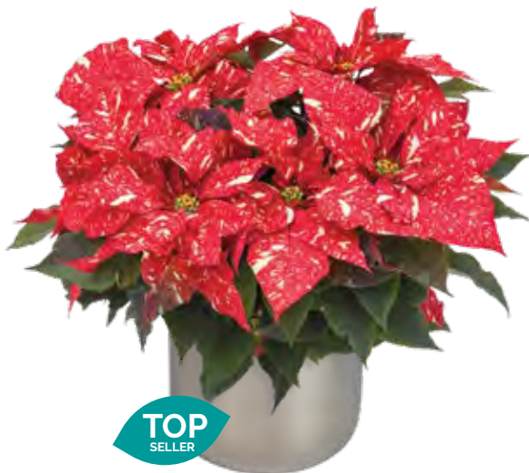
Red Glitter 11317 | 8.5 weeks

Striking colors with horizontal bracts. Heat-tolerant and ideal for tree forms with superior post-production characteristics.