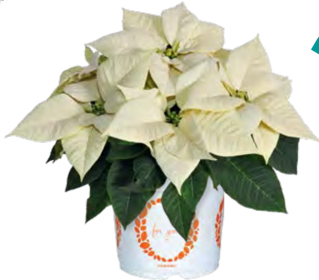
Premium White 10233 | 7 weeks