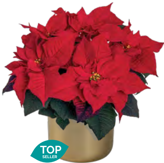
Red Soul 11323 | 8 weeks

This gorgeous mid-season variety's deep velvet-red bracts are striking against intense, dark-green foliage. A standout in all climates, especially the South, Red Soul exhibits excellent heat tolerance on a medium-vigor plant.