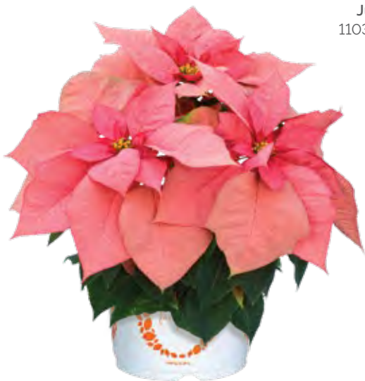
Jubilee Pink 11035 | 8 weeks