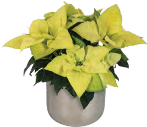
Green Envy 11433 | 7.5 weeks

Green Envy will keep spirits bright. The large, bright chartreuse bracts have outstanding contrast against the dark green foliage and make a bold holiday statement mixed both in our Fall Favorites, as well as with classic reds during the Christmas season.