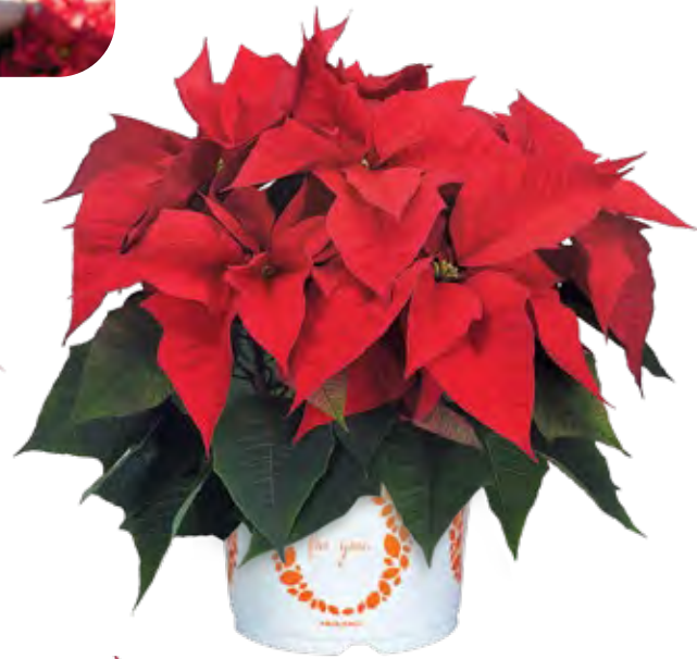
Freedom Red 11020 | 7.5 weeks