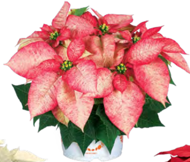
Premium Picasso 10234 | 7.5 weeks