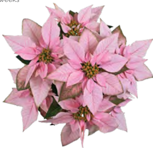
J'Adore Soft Pink 10156 | 7.5 weeks