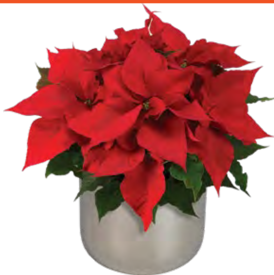
Prestige Early Red 11151 | 7.5 weeks

Prestige Early Red has predictable growth throughout the season.