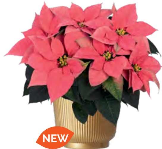
Freya Pink 11057 | 7.5 weeks