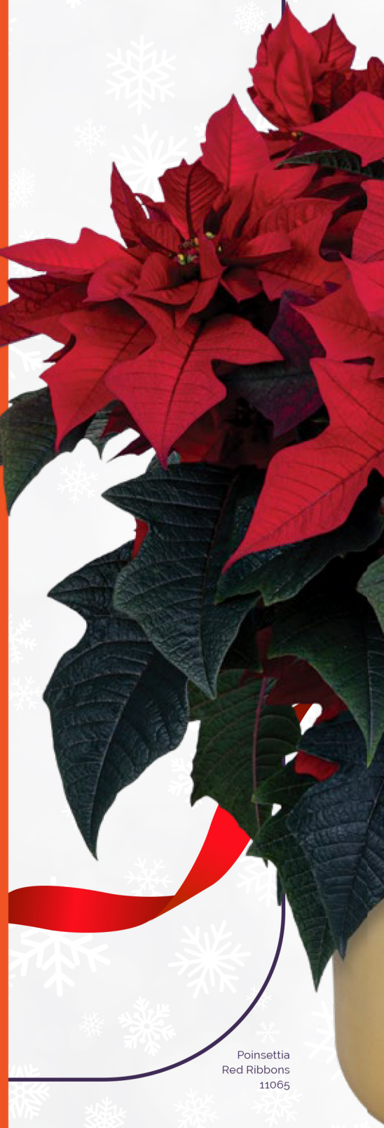
Poinsettia Red Ribbons 11065