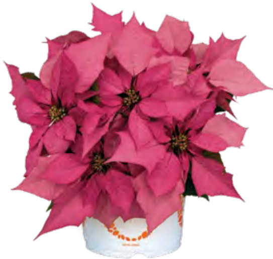
Enduring Pink 11015 | 8 weeks