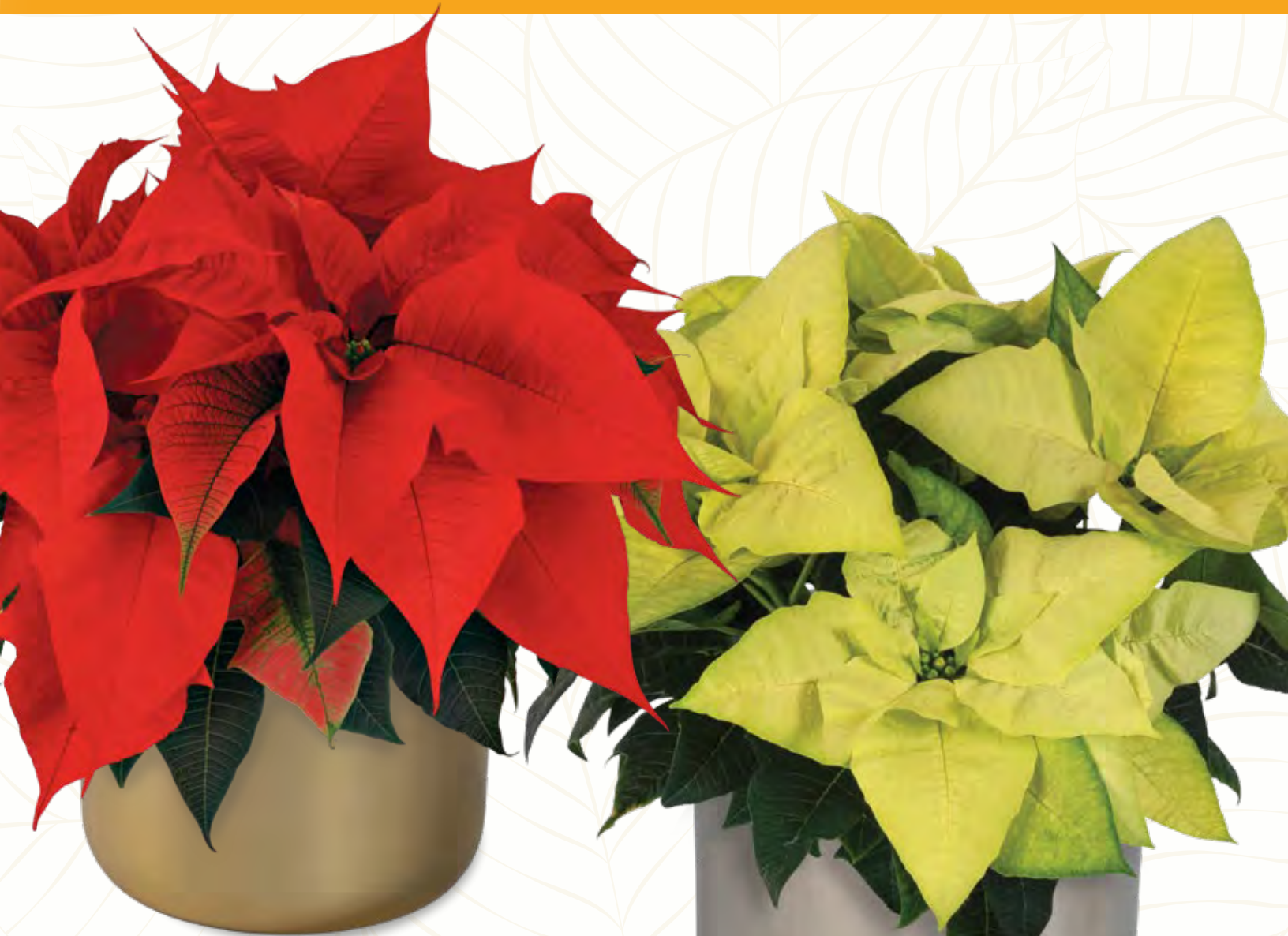
Norwin Orange 11081 | 8 weeks

Our diverse novelty poinsettia breeding offers beautiful autumnal tones that go beyond traditional reds. Natural early timing allows growers to easily offer an early assortment at retail; no black cloth is required to achieve pre-Thanksgiving sales! These early performers with warm autumn hues are the perfect way to earn holiday sales faster. Autumn Leaves has become a consumer staple for Thanksgiving tablescapes and will transition beautifully into your Christmas decor. Paired with the brilliant Norwin Orange, illuminating Golden Glo and the unique Green Envy, this becomes the perfect collection for stylish autumn merchandising.