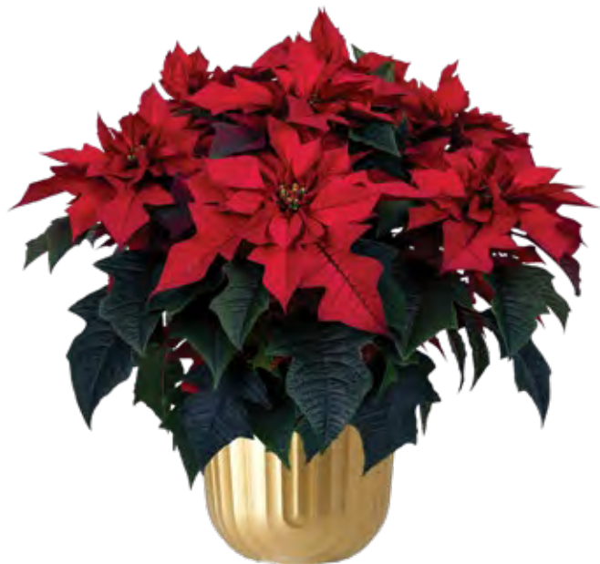
Red Ribbons 11065 | 8 weeks