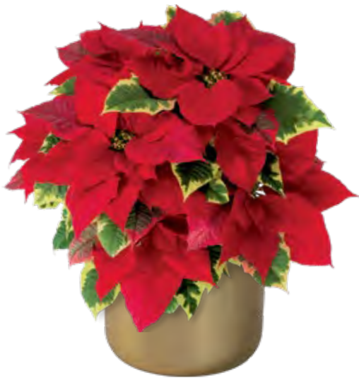
Tapestry 11107 | 8.5 weeks

Tapestry makes an elegant statement with green foliage highlighted with a luxe gold margin. Excellent for combination plantings or as a standalone decorative accent among traditional red varieties.