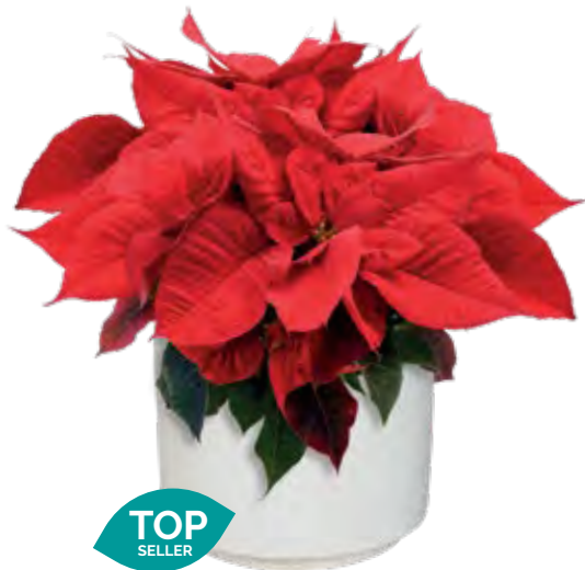
Prestigious 10120 | 8 weeks

One of our most exceptional varieties with mid-vigor and mid-season performance. The plant is extremely tough, handling dropping, sleeving, and shipping with ease. Consumers will love Prestigious with the dark-red textured bracts on a classic green foliage.