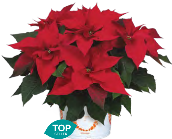
Prestige Red 11150 | 8 weeks

This mid-season variety stands out at retail with reliable and long-lasting shelf life. Prestige is versatile in use and adaptable to any container size.