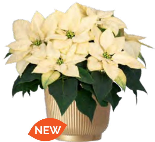
Freya White 11058 | 7.5 weeks