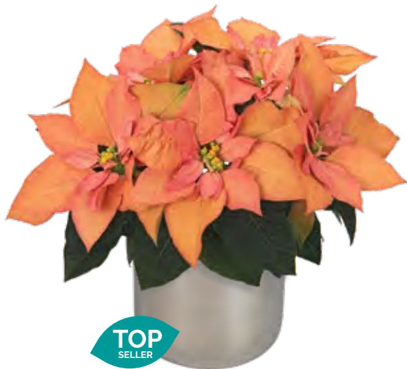
Autumn Leaves 11391 | 8 weeks

Warm golden-peach tones are ideal for Autumn sales.