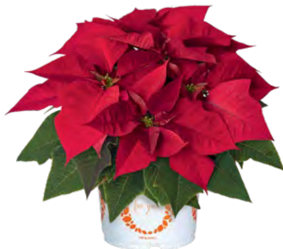
Jubilee Red 11030 | 8 weeks

The mid-season Jubilee family is available in Red, White, Pink and the novel Jingle Bells – a striking red and pink bicolored variety – and is a vigorous family with a classic bract and leaf shape. Jubilee fills larger containers well and is an outstanding performer in both hot and cold climates.