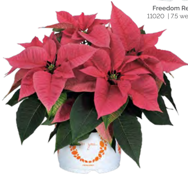
Freedom Pink 11024 | 8 weeks