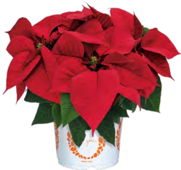
Premium Early Red 10241 | 6 weeks

The Premium Family has been a legacy program for greenhouse growers around the world. This exceptional collection has the traditional reds and white, but also many unique standouts like Ice Crystal and Picasso. Premium varieties finish early with lower vigor for small- to mid-sized containers and early season sales.