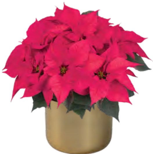
Early Polly's Pink 11055 | 8 weeks

The brightest pink bracts available in a poinsettia. Early Polly's Pink displays an extremely vibrant color at retail and the vigorous plants are great for larger containers and premium presentations.