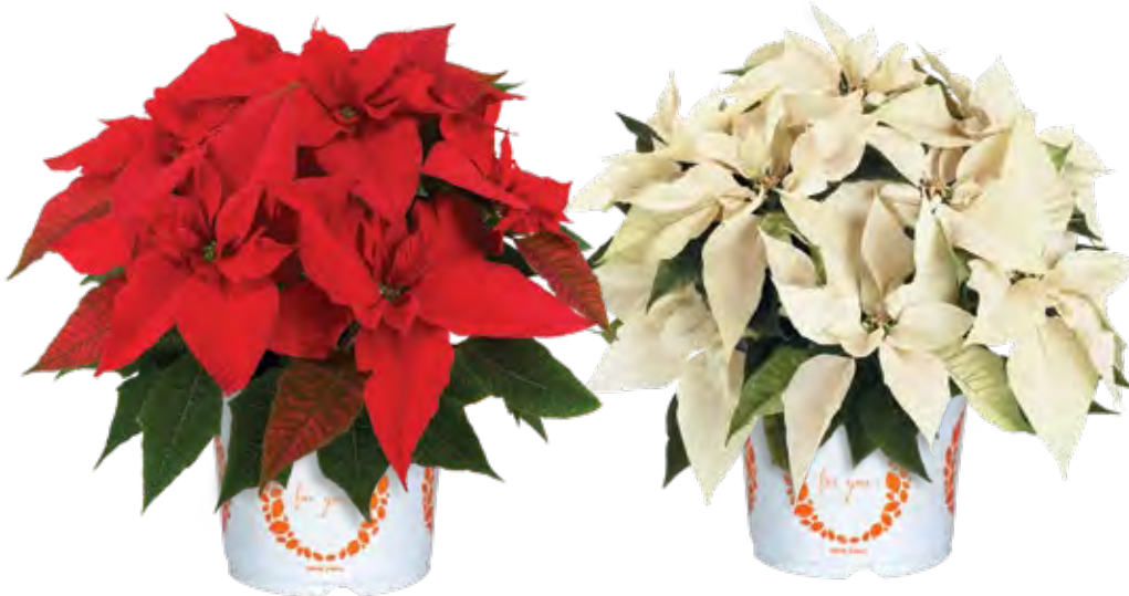
Classic Red 11180 | 8.5 weeks