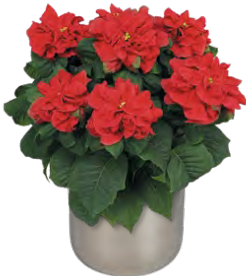
Winter Rose Dark Red 11162 | 8.5 weeks

The ruffled bracts resemble roses for a unique holiday look. The narrow plant habit is great for straight-ups and combination plantings. And originally bred from cutflower production varieties, Winter Rose Dark Red has phenomenal vase life and makes unique Christmas bouquets.