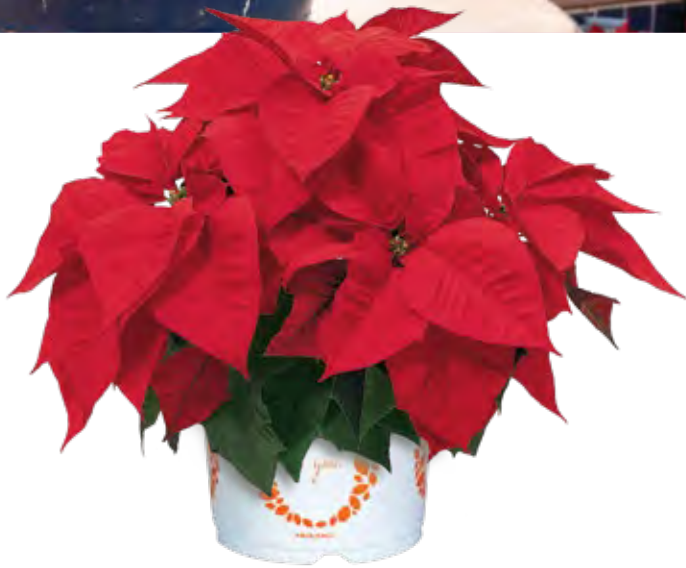
Freedom Early Red 11191 | 7 weeks

More vigorous than the Premium lineup, Freedom varieties are suitable for medium to large containers, which they fill well with large bracts and strong branching. Four colors are available that play well together in combinations.