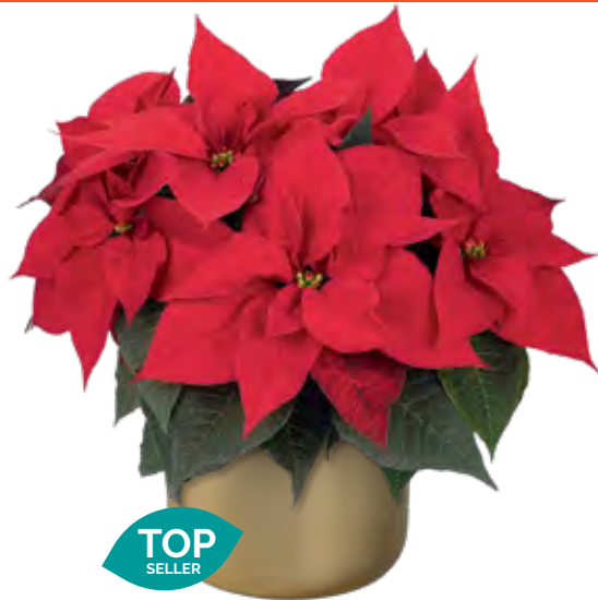
Imperial 10143 | 8 weeks

Imperial is the perfect plant for late November and early December sales. Imperial stands out with its sturdy plant structure and vibrant red large showy bracts; it adds pronounced color to any holiday presentation.