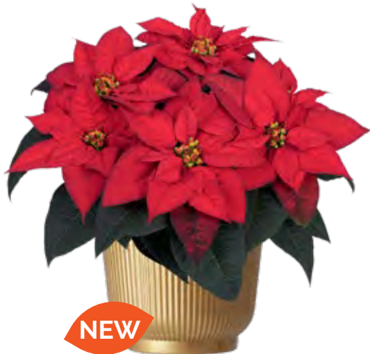
Freya Red 11421 | 7.5 weeks