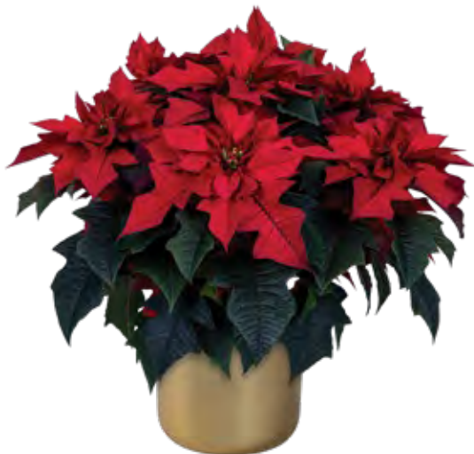
Red Ribbons 11065 | 8 weeks

Introducing Red Ribbons, a true innovation with uniquely shaped bracts and leaves. Red Ribbons is easy to grow with a low to medium vigor and its free branching allows the florist-type quality. With its uniquely shaped oak leaf bracts in bold red color and abundant cyathia, it will be the perfect plant to use with foliage combinations or as a novelty standalone.