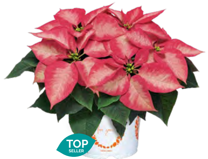
Premium Ice Crystal 10244 | 75 weeks