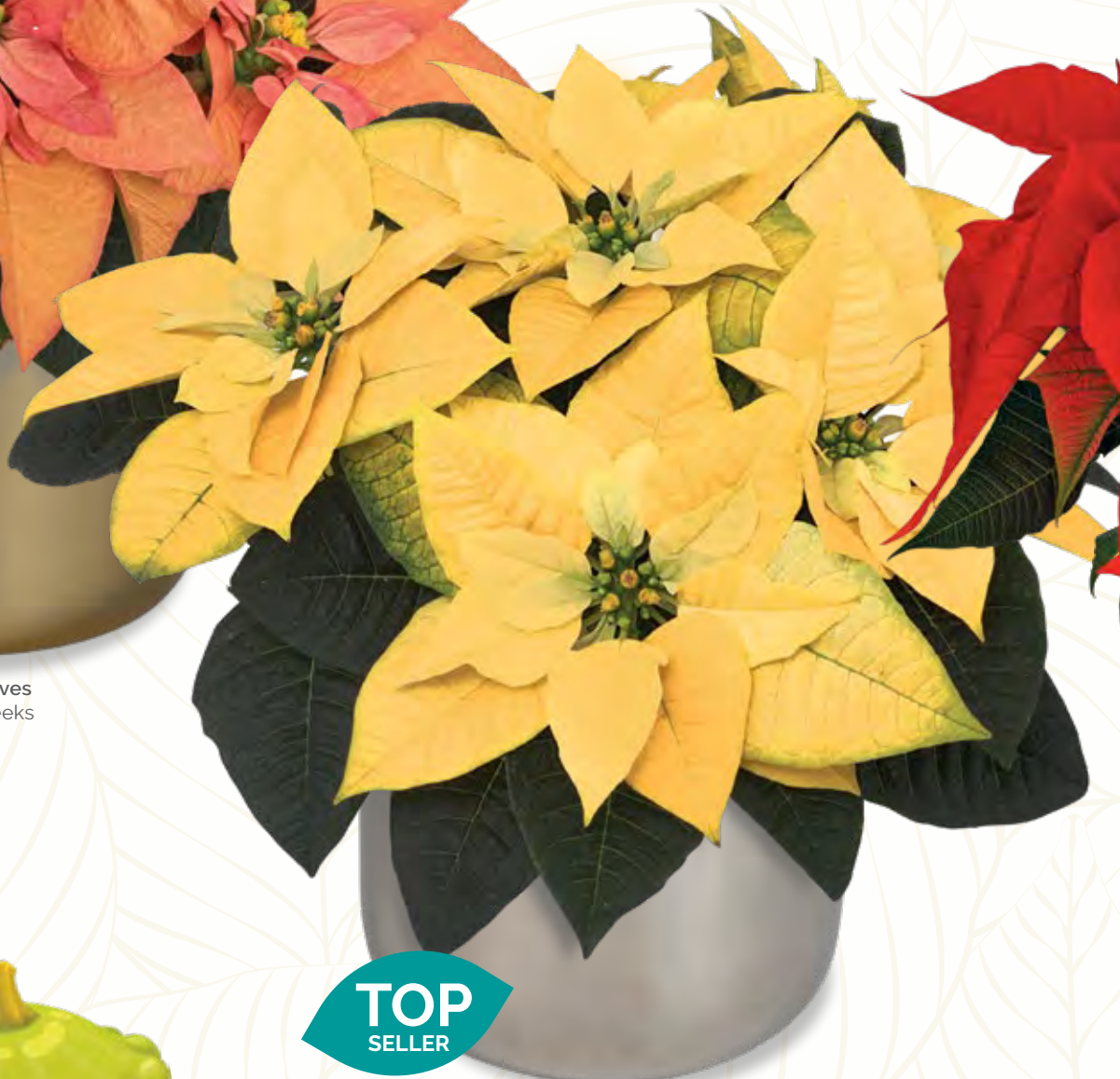
Autumn Leaves 11391 | 8 weeks