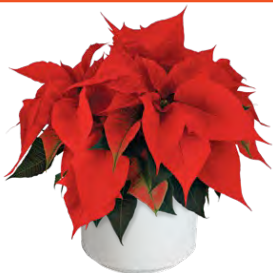
Norwin Orange 11081 | 8 weeks

Norwin Orange is a true breakthrough for this novel color. By far the brightest orange available on the market today. This mid-vigor variety has immense bracts in a vivid color perfect for Halloween and Thanksgiving promotions. Named after a long-time partner of the Ecke program, Norwin Heimos, this variety will also be a legacy in poinsettia programs for years to come.