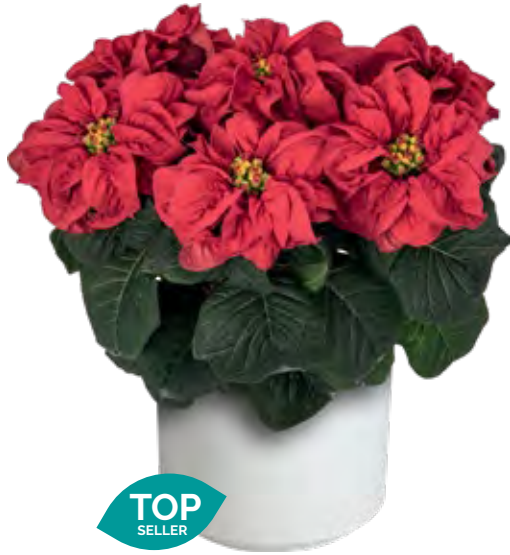
Winter Rose Early Red 10993 | 7.5 weeks

An early-season specialty variety, Winter Rose Early Red has ruffled bracts which resemble roses. The narrow plant habit is great for straight-ups and combination plantings for a unique holiday look.