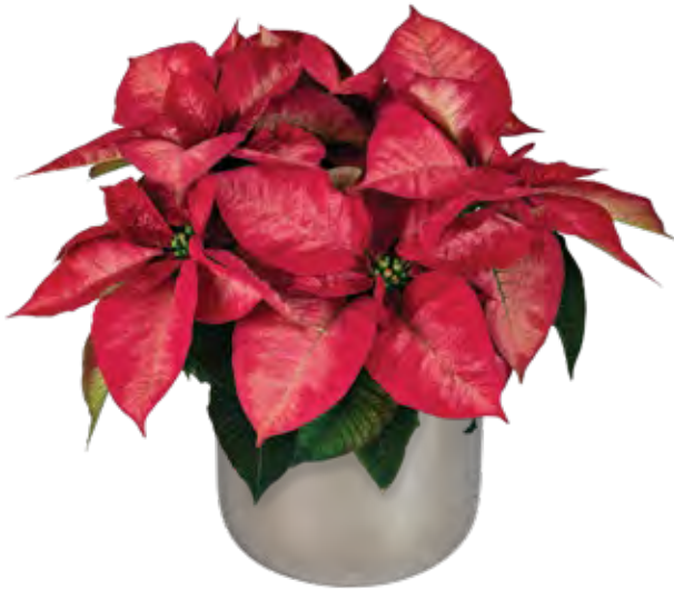
Tidings Dark Pink 11049 | 8 weeks

Tidings is an elegant addition to the modern-day Christmas décor. Tidings Dark Pink have a dense, medium habit with large, florist-quality bracts finishing with a sophisticated quality.