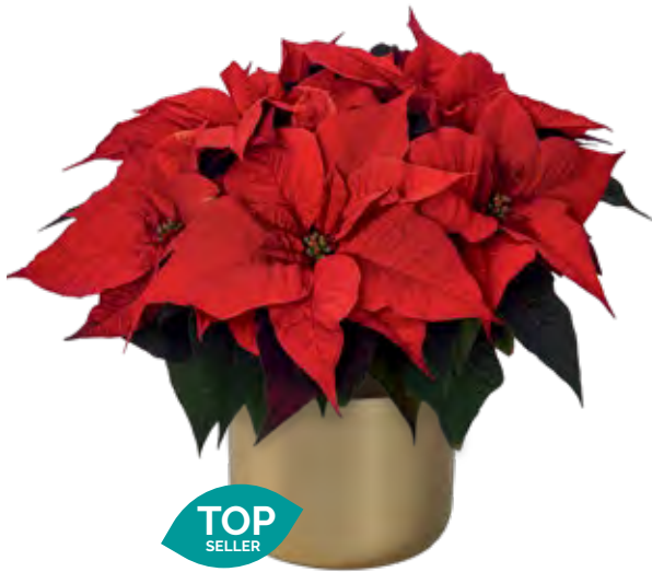
Grande Italia 10330 | 8.5 weeks

Make a statement with this showstopping red variety, perfect for late-season quality sales. This high-vigor poinsettia fills out larger containers nicely with large and dramatic, deep red bracts. Cyathia are slow to open, providing the longest-lasting quality throughout the season.