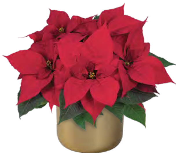
Viking Pro 10144 | 8 weeks

Offering a similar bract shape and color to the favorite Viking Red, Viking Pro exhibits a more compact stature in comparison. Attractive bracts contrast beautifully against the vivid yellow cyathia and dark green foliage.