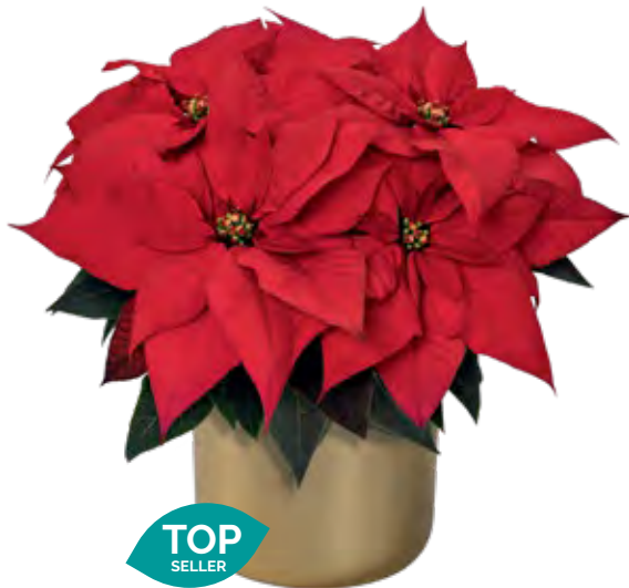
Ferrara 10897 | 7.5 weeks

Strong vigor and a fast response time make this standout a top pick for the grower. This reliable variety offers excellent branching and a V-shaped habit making it ideal for production and sleeving. It is a newer stand-alone selection that boasts beautiful, deep-red bracts and is perfect as an upscale decoration.