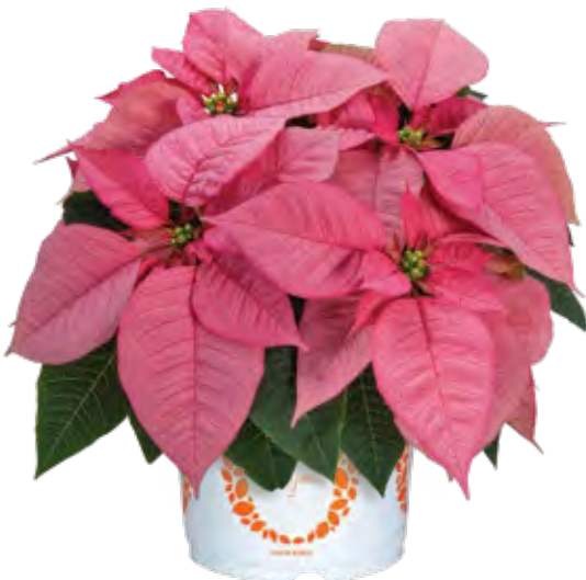
Premium Lipstick Pink 10235 | 75 weeks