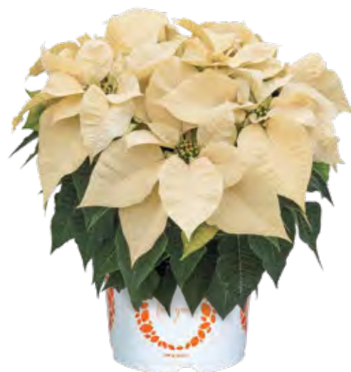
Jubilee White 11033 | 8 weeks