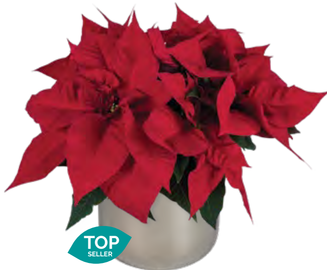
FabYULEous 10104 | 8 weeks

We believe the name speaks for itself, as this variety is nearly perfect for any situation. FabYULEous has an elegant dark-red bract color for a warm Christmas mood. The plants have a moderate habit that requires very little growth regulators.