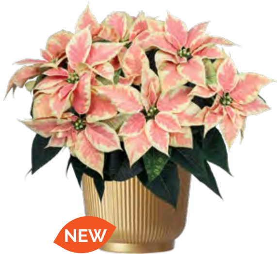
Freya Marble 11126 | 7.5 weeks

Our new Poinsettia varieties consist of stunning singles Rapid Red and Noblesse, plus Freya, a brand new series, consisting of Marble, Pink, Red and White! Red Jewel and Red Ribbons were new in 2024 and they have proven to be a crowd favorite.