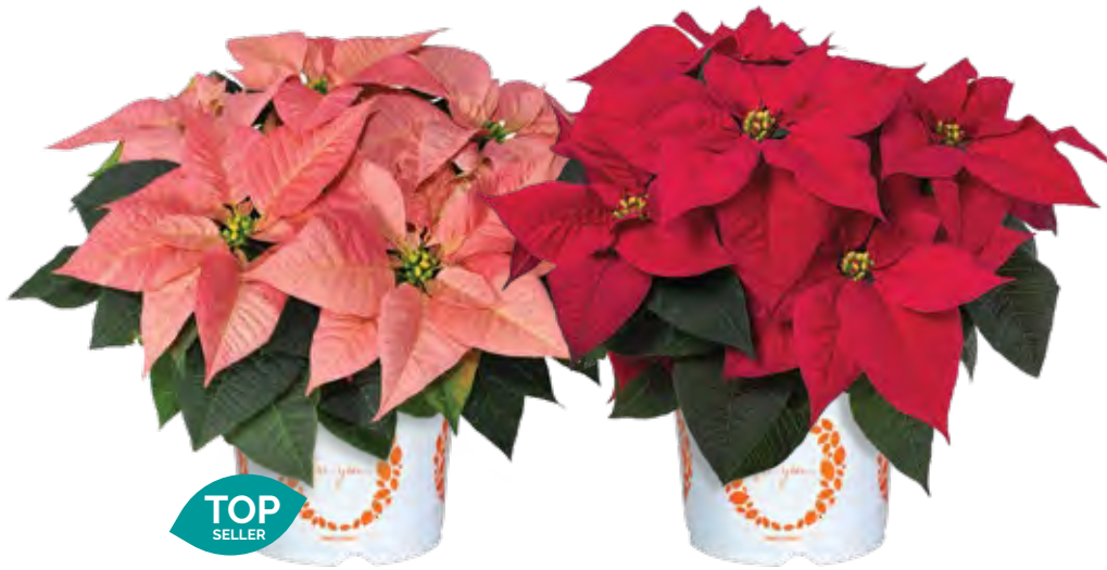
Viking Cinnamon 10657 | 8 weeks