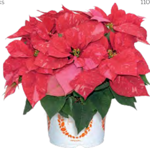
Jubilee Jingle Bells 11036 | 8 weeks