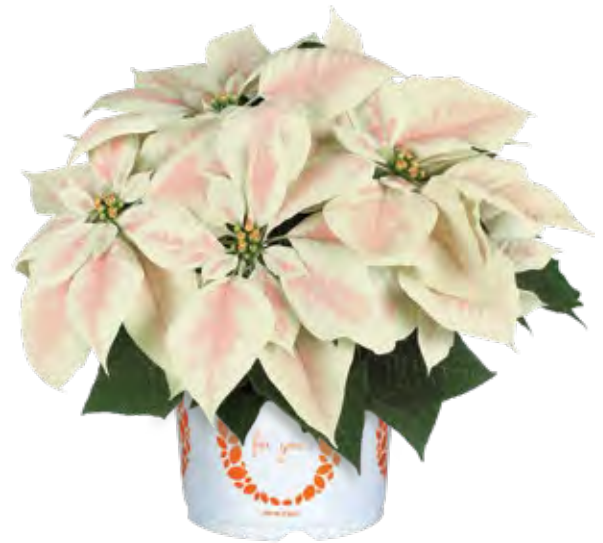
Premium Marble 10249 | 7 weeks