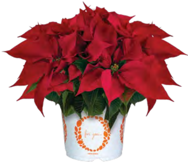
Enduring Red 11010 | 8 weeks

The Enduring family fills the mid-season holiday call with their attractive oak leaf-shaped bract in red, white, pink and marble. Enduring colors are tried and true in all regions and work well mixed in duo or tri-color pots.