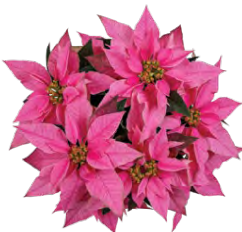
J'Adore Pink 10381 | 7.5 weeks