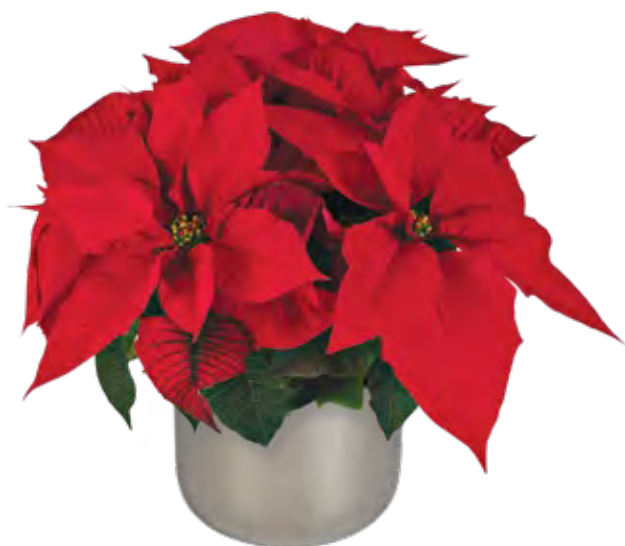
Runway Red 10101 | 8 week

Runway Red will grab attention with the large, vivid red bracts and boldly presented cyathia. This industrial strength variety has strong vigor and a broad and spacious habit for bold presentations, while also having the durability to go the distance throughout the season.