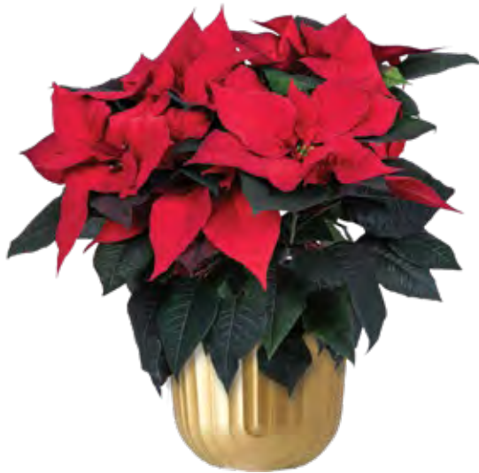
Red Jewel 11072 | 8.5 weeks

Red Jewel will be the new showstopper for mid-to-late-season sales with its full body yet controllable growth. The saturated dark red bracts look elegant over the dark green foliage, creating an elegant and upscale looking Poinsettia.