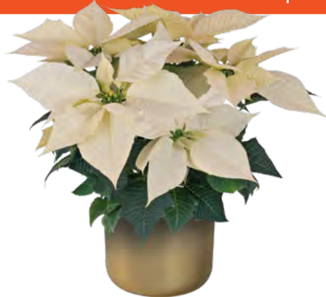
Flurry 11051 | 8 weeks

Flurry is hitting the scene as our brightest white yet. With a traditional bract presentation and dark green foliage, it will become the staple white in your program. Flurry is a robust plant from roots to shoots for production ease with controllable vigor suitable for various container sizes. Flurry is an outstanding choice for painted programs with large, flat bracts.