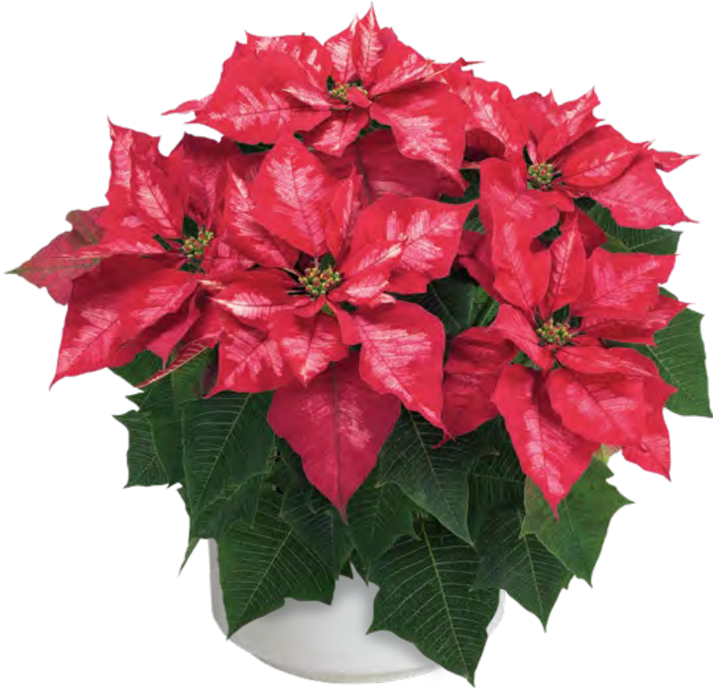
Ice Punch 11216 | 8 weeks

Ice Punch has a truly novel bicolor effect with deep cranberry-red bracts, frosted over with an icy white center.