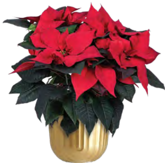
Red Jewel 11072 | 8.5 weeks