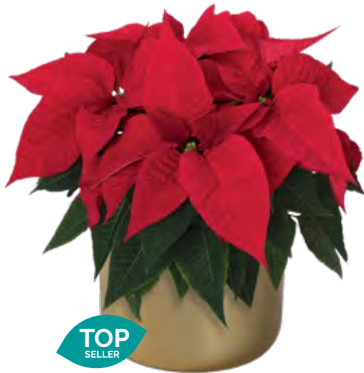
Southern Belle 10908 | 8.5 weeks

Southern Belle is a beautiful florist-type poinsettia for December sales. It is a medium vigor plant with bright red bract and a strong v-shaped structure.