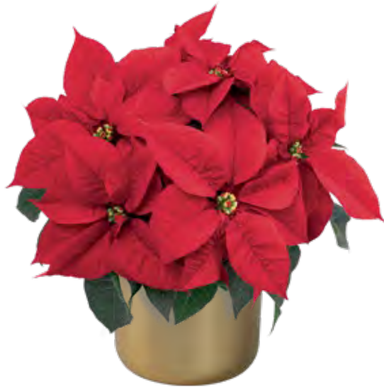
Atla 11423 | 8 weeks

This strong, bright-red mid-season performer is a perfect pick for mass production. Atla has a strong V-shaped habit, perfect for high-density production, and the medium-sized bracts make sleeving and shipping a breeze.