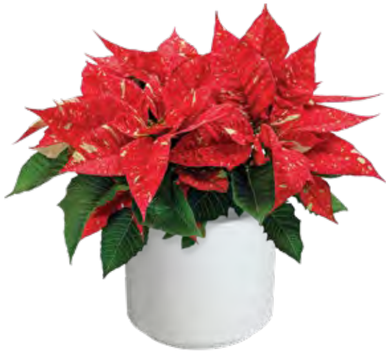
Candy Cane 10153 | 8 weeks

This truly special selection presents red bracts embellished with fun, white speckles, providing a striking contrast against dark-green foliage. The classic star-shaped bracts are large and showy and create an impressive display at retail. Strong stems and a strong root system make this poinsettia an excellent choice for a range of container sizes, from miniature up to 10-inch.