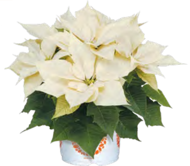
Enduring White 11013 | 8 weeks