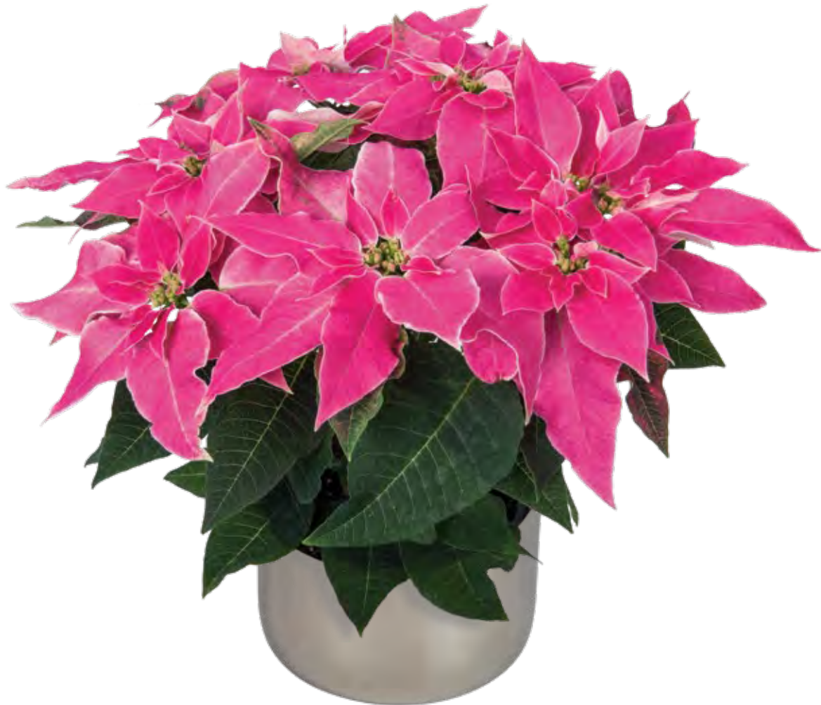
Luv U Pink 11109 | 9 weeks

A standout in any setting, Luv U Pink is an explosive plant. The most vigorous in its class, it is suitable for larger containers as well as the landscape. It has a later response time compared to other euphorbias.