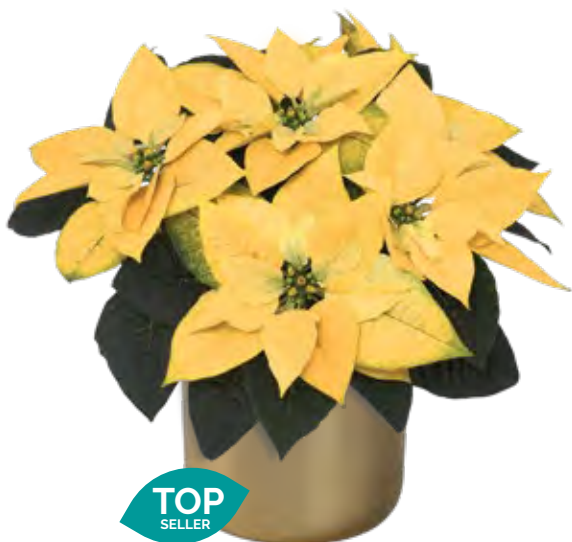
Golden Glo 11431 | 8 weeks

The unique golden color of Golden Glo intensifies as the bract matures – a striking choice for red and gold holiday pairings.